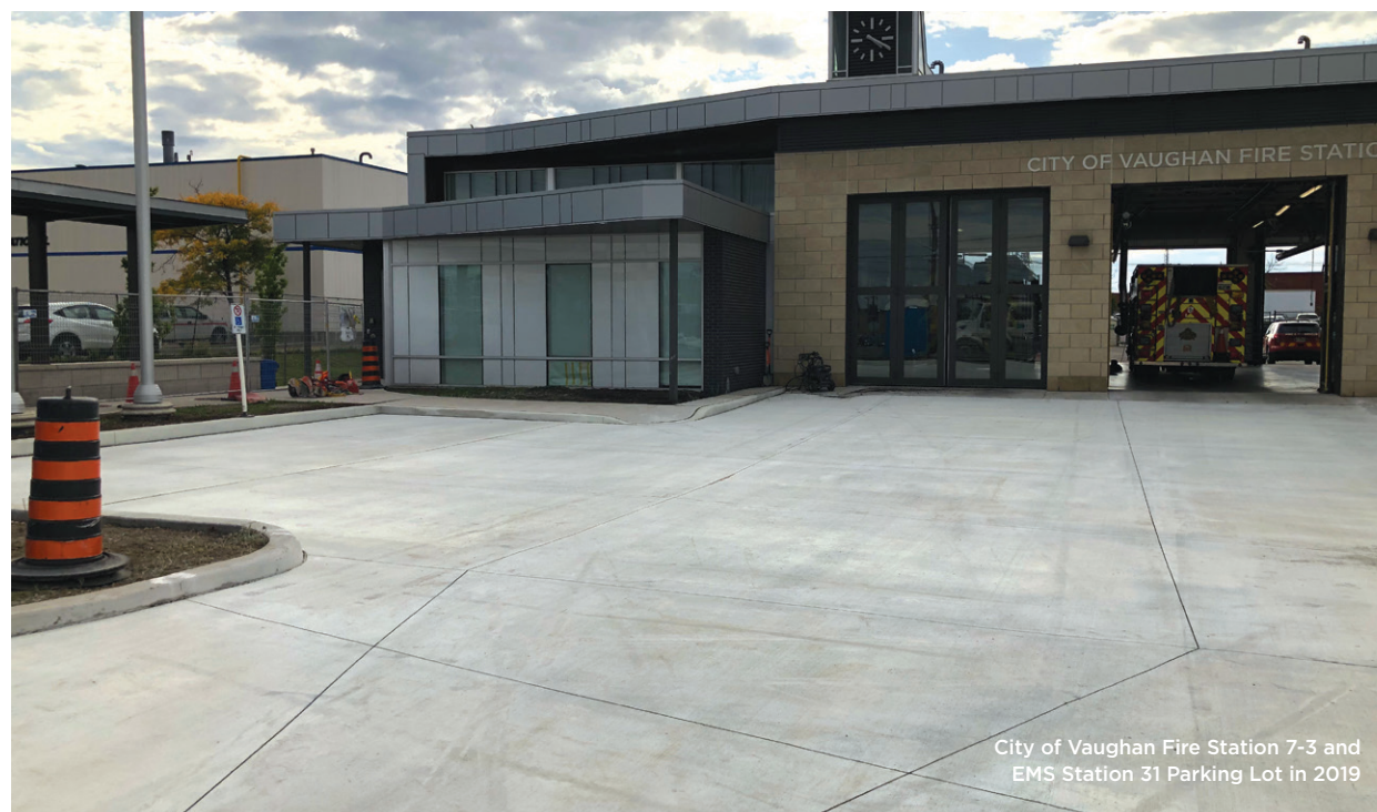
City of Vaughan Fire Station 7-3 and EMS Station 31 Parking Lot in 2019