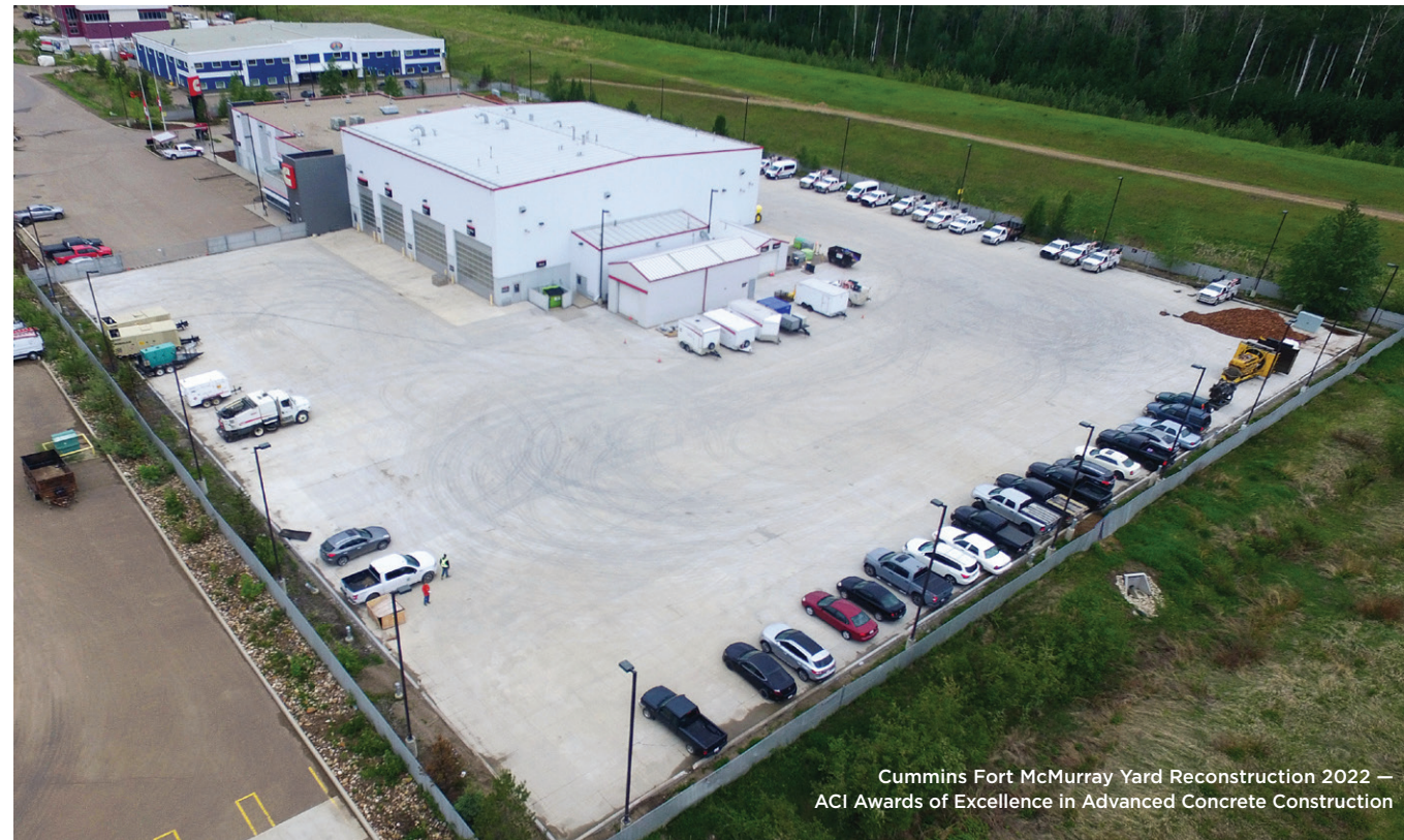
Cummins Fort McMurray Yard Reconstruction 2022 — ACI Awards of Excellence in Advanced Concrete Construction